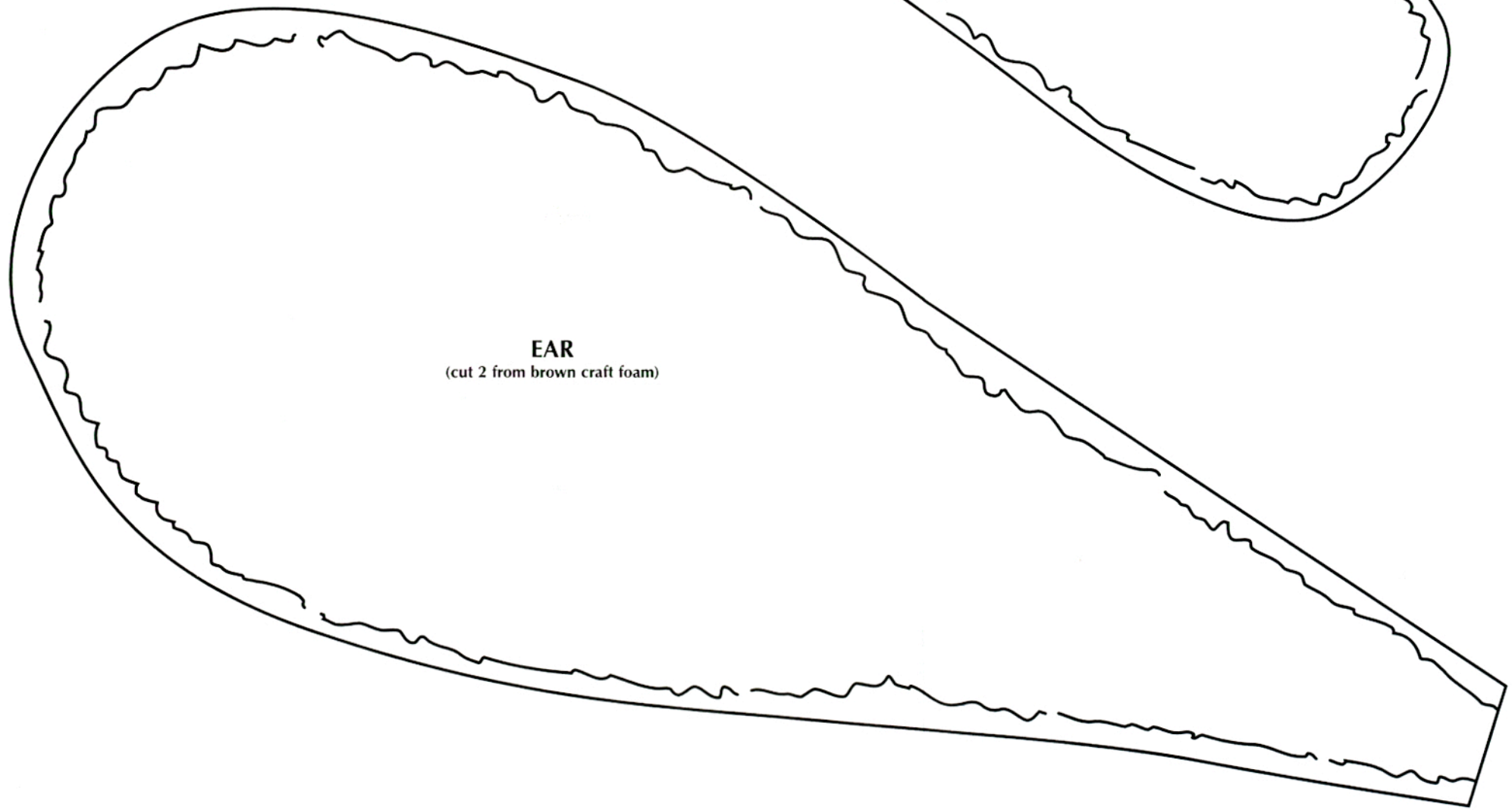
EAR (cut 2 from brown craft foam)